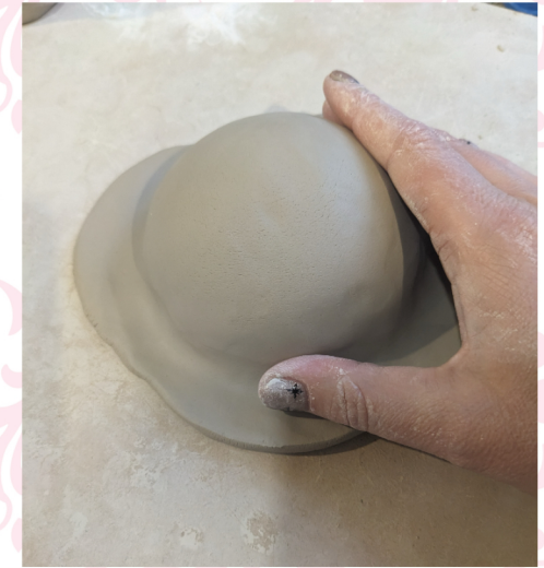
17. Drape your rolled clay over the dome and firm around the shape