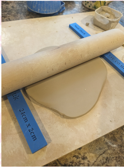
15. Time to make the top of your toadstool... roll out your clay to 7mm thick