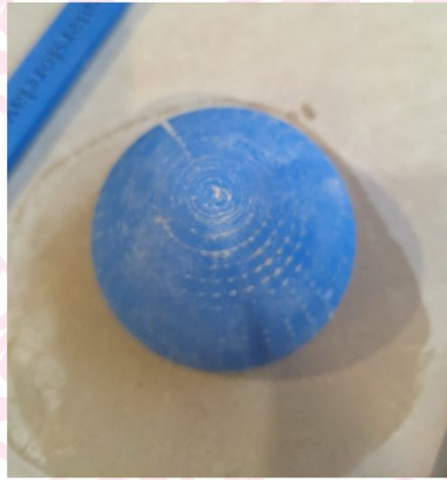
16. Dust your dome form with talc or cornflour to prevent your clay from sticking