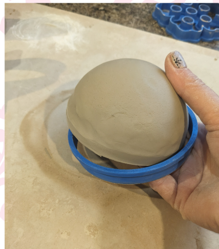
19. Push the dome through the cutter to get a nice neat edge