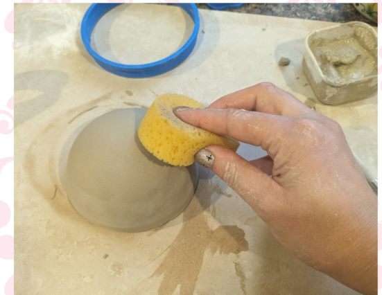
20. Smooth out any imperfections on the dome and the edge with a damp sponge