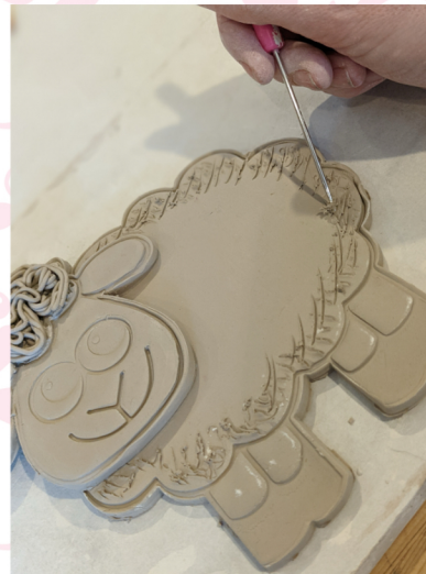
11. Make your 'wool' for your sheep's body and add slip to the area you've already scored