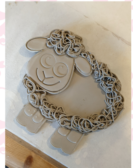
12. Layer up your 'wool' and ta-dah!