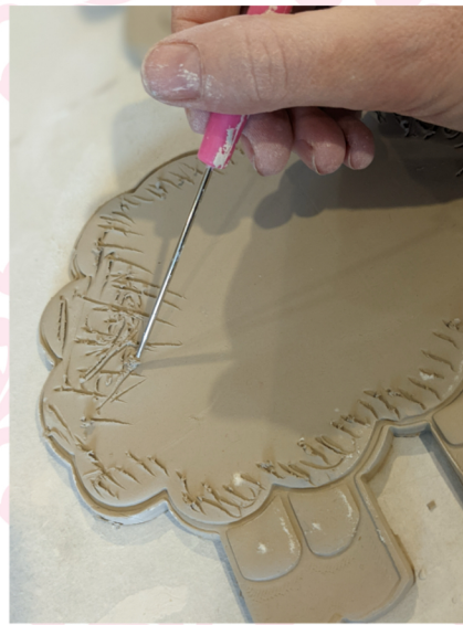
8. Score the sheep's body where you want to attach wool and an area to attach the head