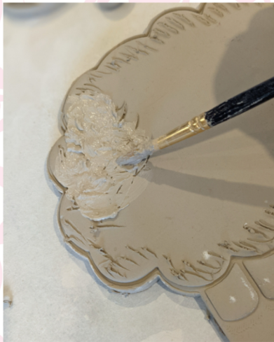
10. Paint of slip onto the scored areas on the body and back of the head and firm the head into place