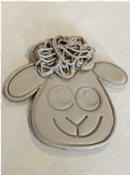
7. Layer up your wool to make your sheep's fluffy head