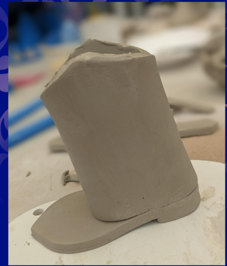
8. attach the boot to the sole like this