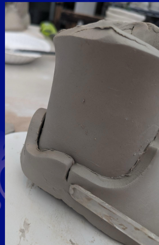
16. Attach in place, lining up the joins and blend these together