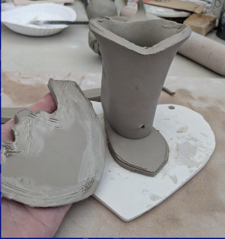
12. score and slip the piece shown and around the EDGE of the sole