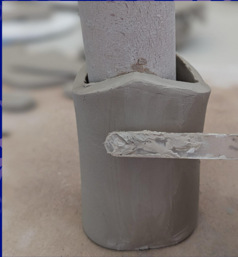
6. Blend thoroughly so you can't see the join