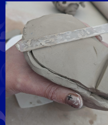
17. Pick up the boot and blend in the joint underneath