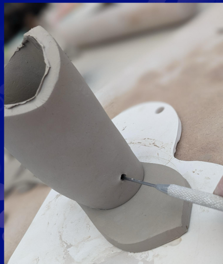
10. add an air hole at the front of the boot