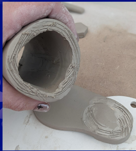
7. score and slip the flat edge of the boot and where it's going on the sole