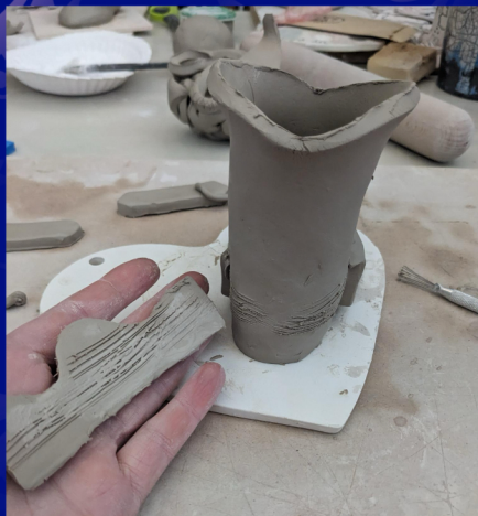
15. Score and slip the back piece and the boot above the heel