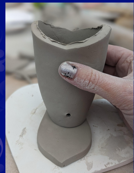
11. squeeze the boot into shape. Check how it looks from all angles