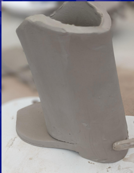
9. Smooth around the seam so you can't see the join