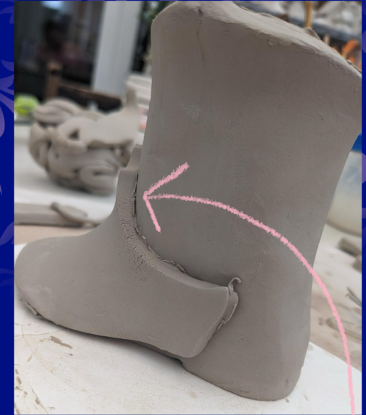
14. Then firm the rest into place here