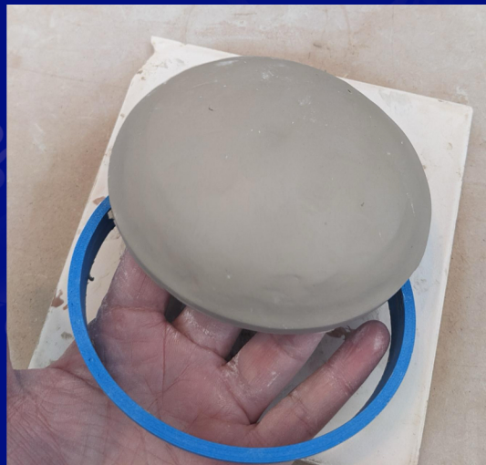
5. Press the mould and clay up through the cutter