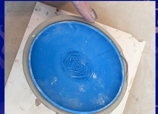
6. Turn over and smooth the edges of your clay