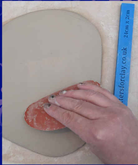
1. Roll out your clay to 7mm thick and smooth out