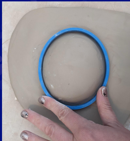
4. Place the cutter over the mould and press down to cut through the clay