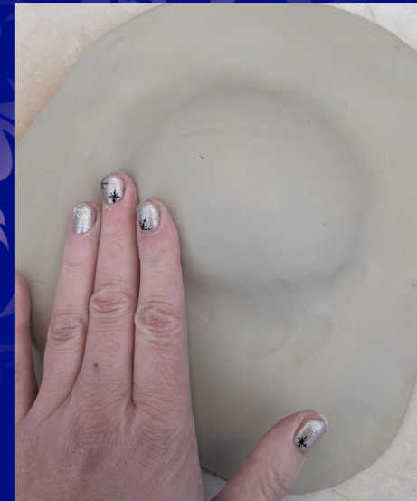
3. Drape your clay over the mould. Smooth the clay around the mould