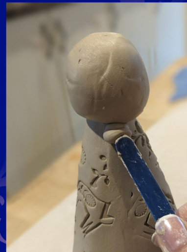
11. Paint slip inside the ball and place over the point. Blend in extra clay to secure at the back of the neck