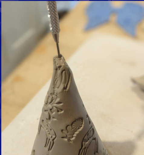
10. Make a hole in the top of the cone so air can flow through