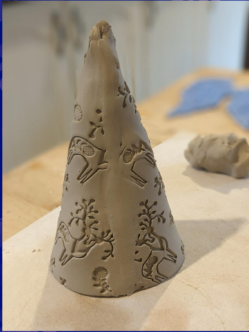
7. This will be the back of your angel