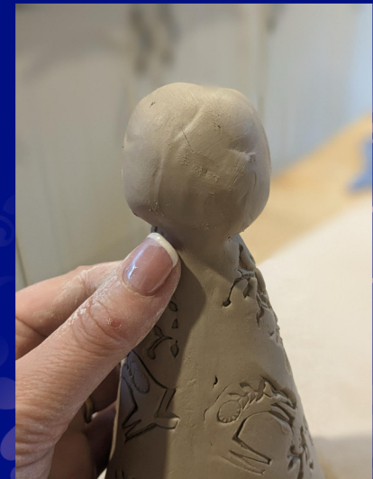
12. Smooth in so it's nice and neat