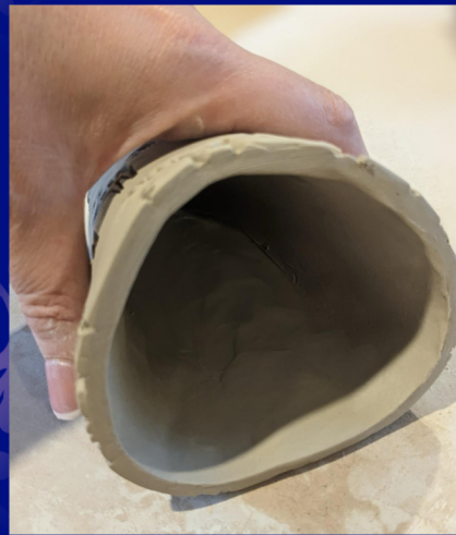
8. Repeat step 6 on the inside seam